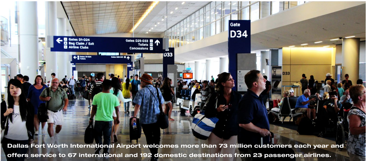
Dallas Fort Worth International Airport welcomes more than 73 million customers each year and offers service to 67 international and 192 domestic destinations from 23 passenger airlines.