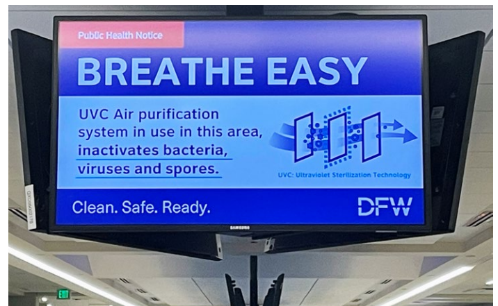
Dallas Fort Worth International Airport installed UV-C systems from UV Resources

Designed for high-volume HVAC environments, the versatile RLM Xtreme can be installed in almost any position to generate 360-degree high output UV-C irradiation to inactivate bacteria, viruses, molds, and other pathogens—including antibiotic-resistant superbugs. The