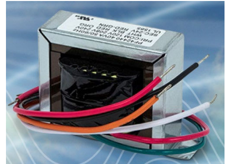
24V Hardwire Step-Down power supply can be used with the UV Resources Hornet, Stinger and UVReport.